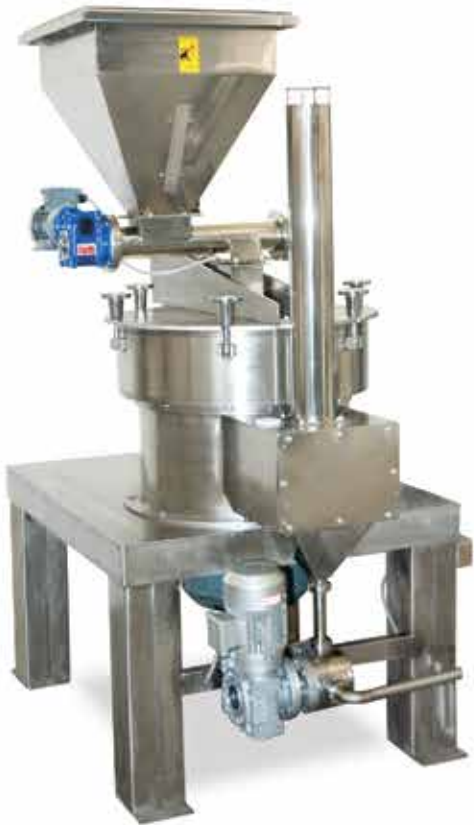
HAZELNUT MILL Capacity: 450 Kg/h 110μ