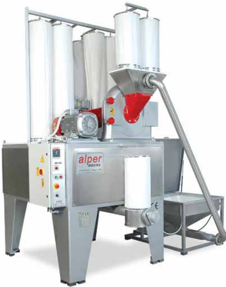
SUGAR GRINDING MILL Capacity: 500-1000 Kg/h 50 \mu