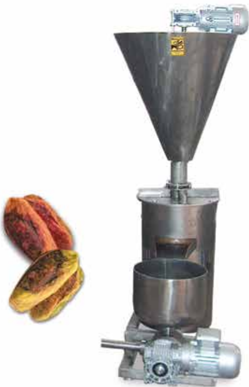
HAZELNUT MILL Capacity: 100 Kg/h 110μ