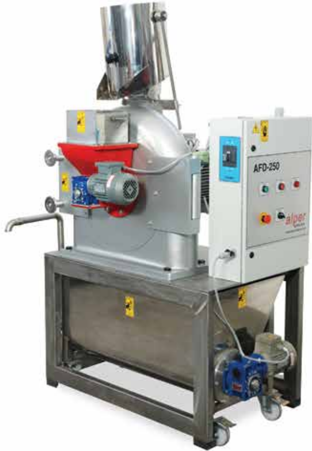
HAZELNUT MILL Capacity: 250 Kg/h 110μ