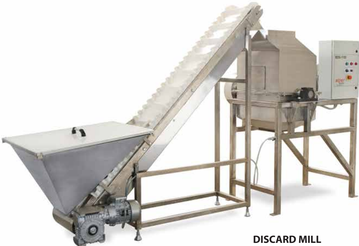
DISCARD MILL Capacity: 600-1200 Kg/h