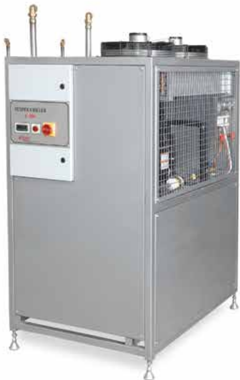
TEMPER CHILLER Capacity: 250-2200 Kg/h