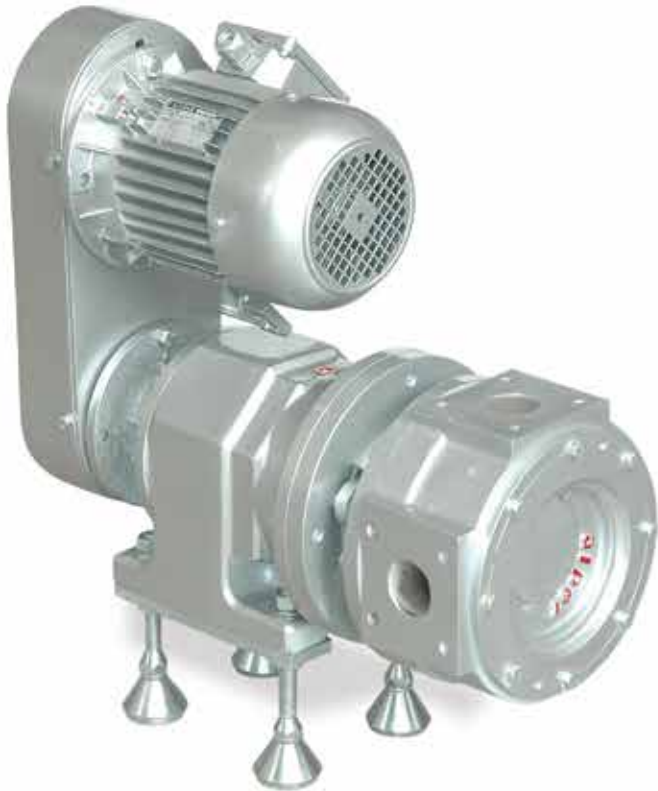
CHOCOLATE PUMP Capacity: 3000 Kg/h