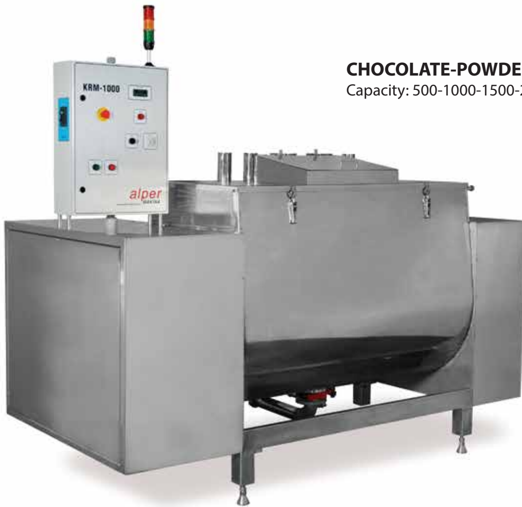
CHOCOLATE-POWDER MIXER Capacity: 500-1000-1500-2000 Kg