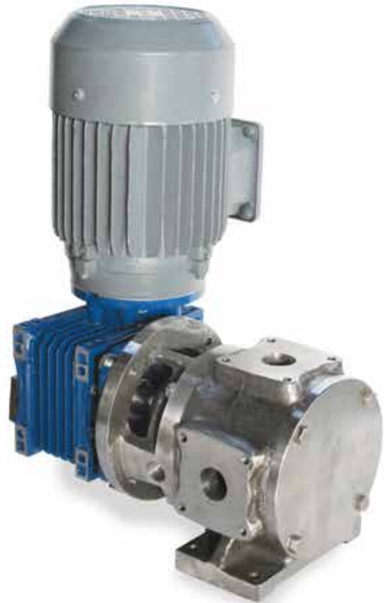
CHOCOLATE PUMP Capacity: 1000 Kg/h