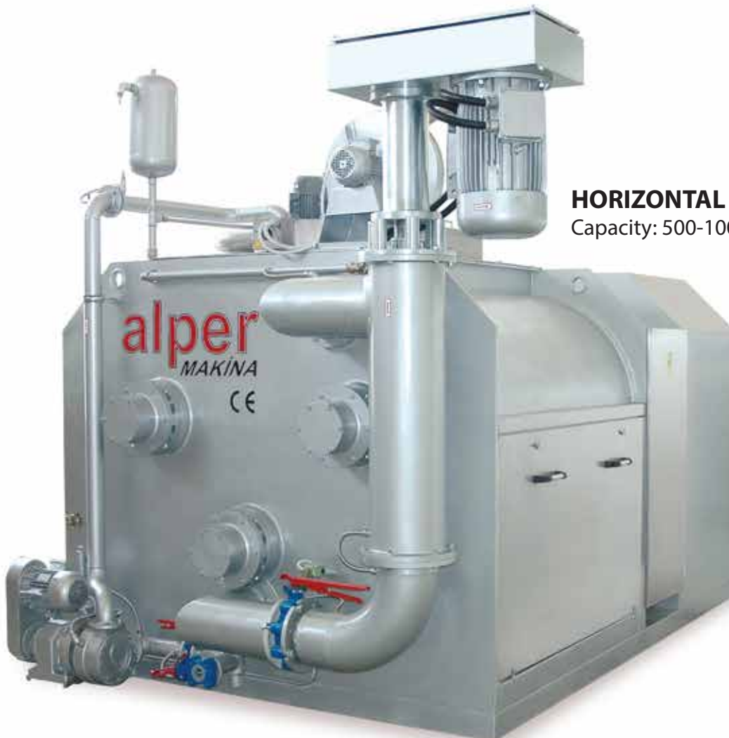
HORIZONTAL CONCHES Capacity: 500-1000-2000-4000 Kg