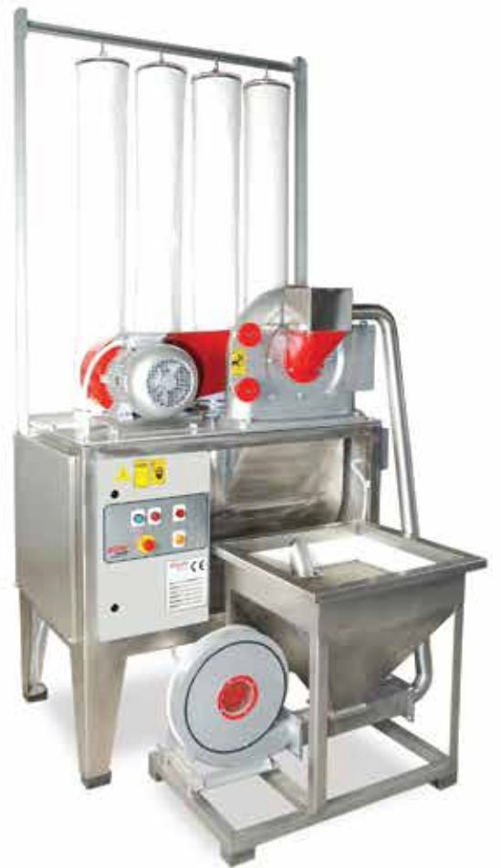
SUGAR GRINDING MILL Capacity: 250 Kg/h 50 \mu