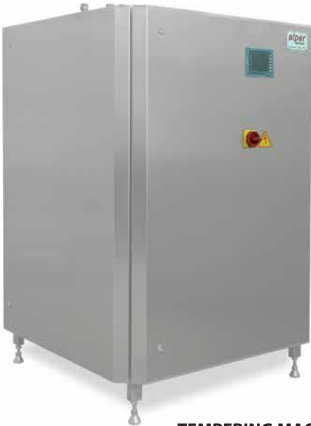
TEMPERING MACHINE Capacity: 250-2200 Kg/h